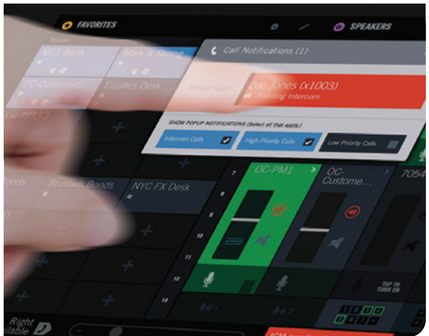
Tap or swipe to answer call on right or left handset

Go ahead – touch, tap, swipe, drag and drop – you're ready to do exactly what you want.